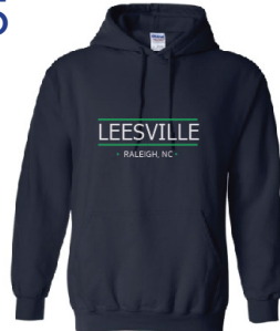
Leesville Raleigh Hoodie