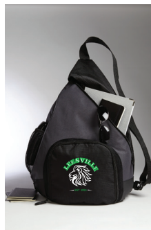
Leesville Sling Bag