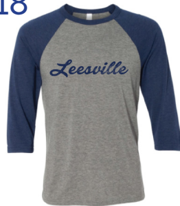
Leesville script Baseball shirt