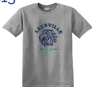
Leesville Lion Head