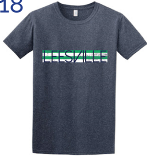
Premium- Leesville Retro Stripes