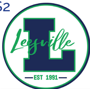
Leesville Block Script Sticker