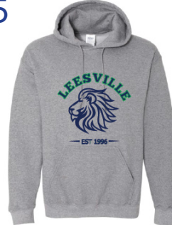
Leesville Lion Head Hoodie