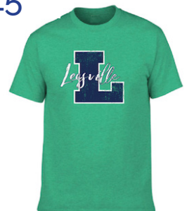
Leesville Block Script