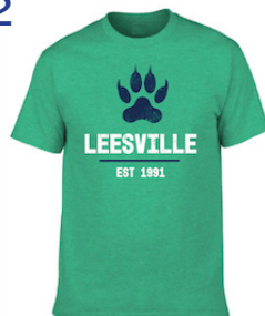
Leesville Paw- Green