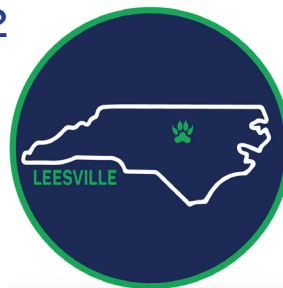
Leesville State Sticker