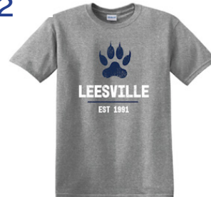
Leesville Paw- Grey