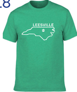
Premium- Leesville State