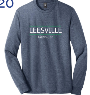
Soft Long Sleeve- Leesville Raleigh