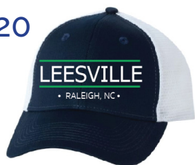
Leesville Snap Back Trucker Hat