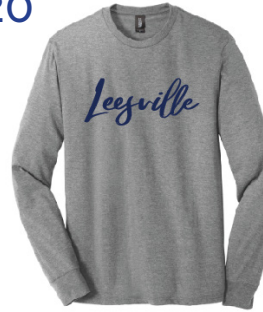
Soft Long Sleeve- Leesville Script